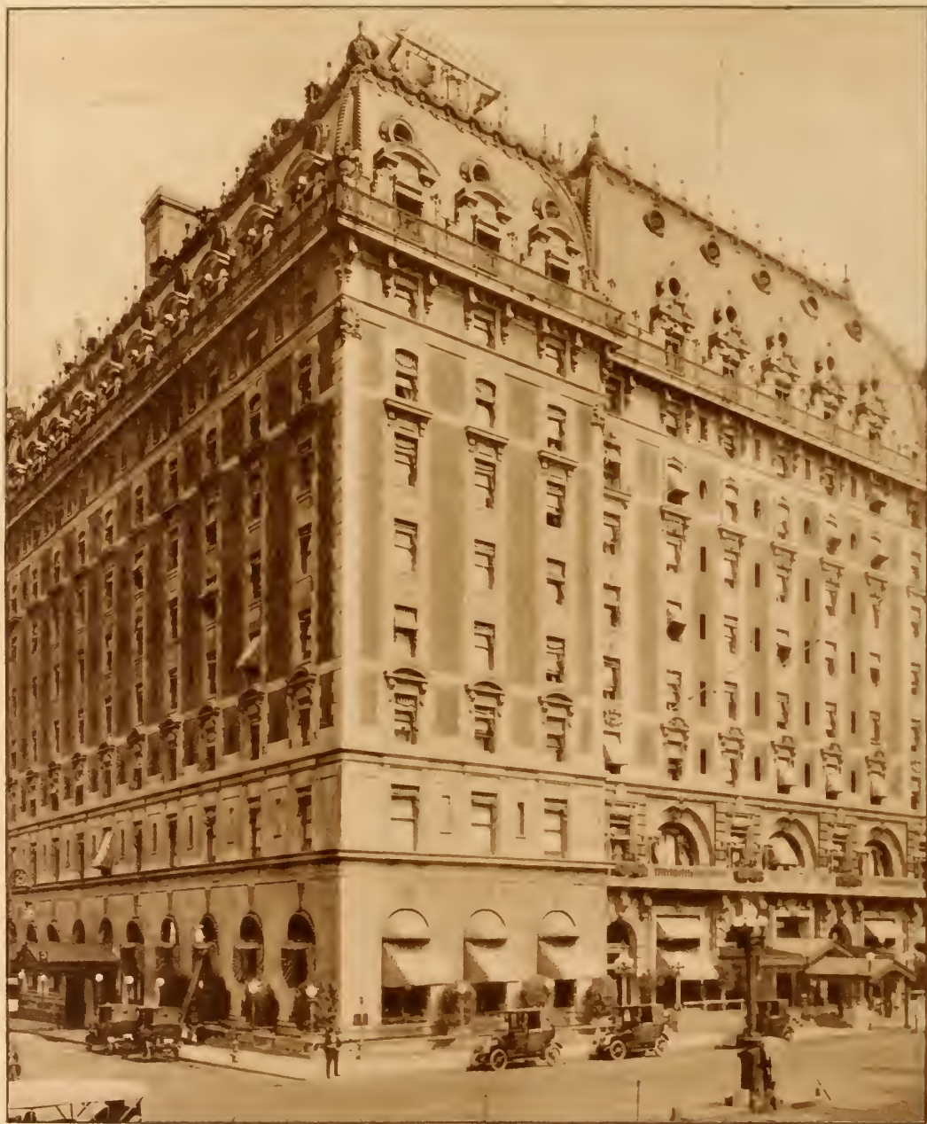
HOTEL ASTOR OCCUPIES THE ENTIRE BLOCK AT BROADWAY AND 44th STREET. Its great ball room has been and still is the scene of many famous social functions.